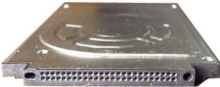
FIGURE 3 – INTERFACE CONNECTOR